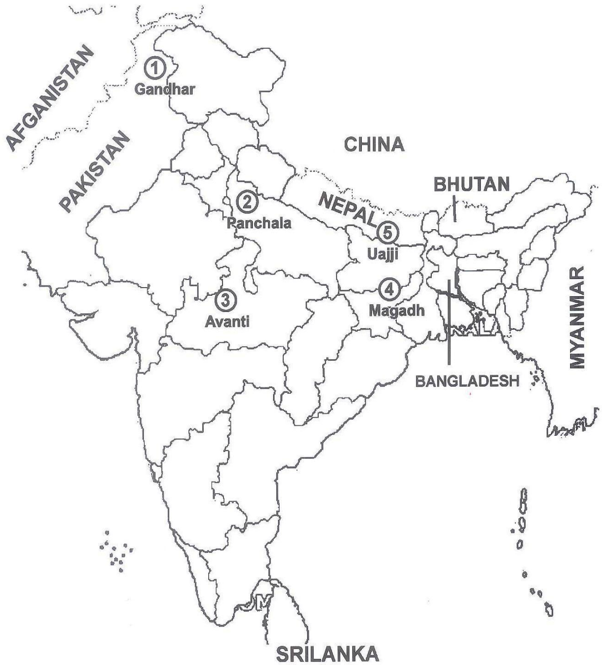
Map of India and the Neighbouring Countries